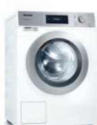
Little Giant PWM 507 [EL DV]