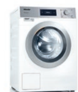
Evolution PWM 307 [EL DP]