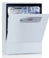
PG8581 Washer disinfector

With each PG8581 washer disinfector for veterinary practices, we include: