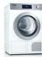
Evolution PDR 307 [EL]