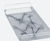
E142 half width mesh tray